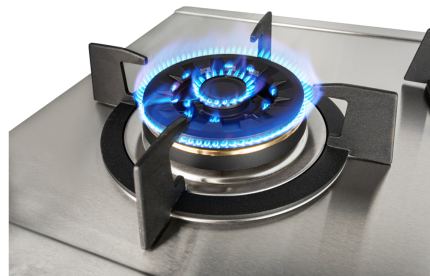
3 Rings Burners