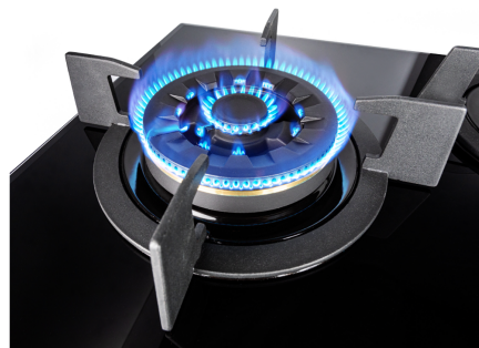
3 Rings Burners

www.ef.com.sg EF Home Appliances @efappliances