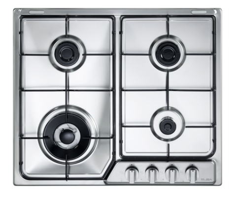
MADE IN ITALY