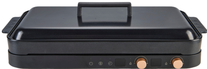
DOUBLE-O Induction Hotplate