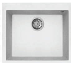
Pearl White (WH)