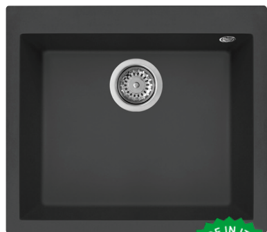
Pearl Black (PB)