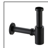
CBA-203-BT1/BK Brass bottle trap Black