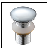
CBA-201CH Chrome waste