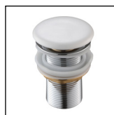
CBA-201CR/W Ceramic waste White