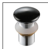
CBA-201CR/B Ceramic waste Black