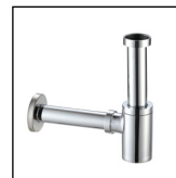
CBA-203-BT1/CH Brass bottle trap Chrome